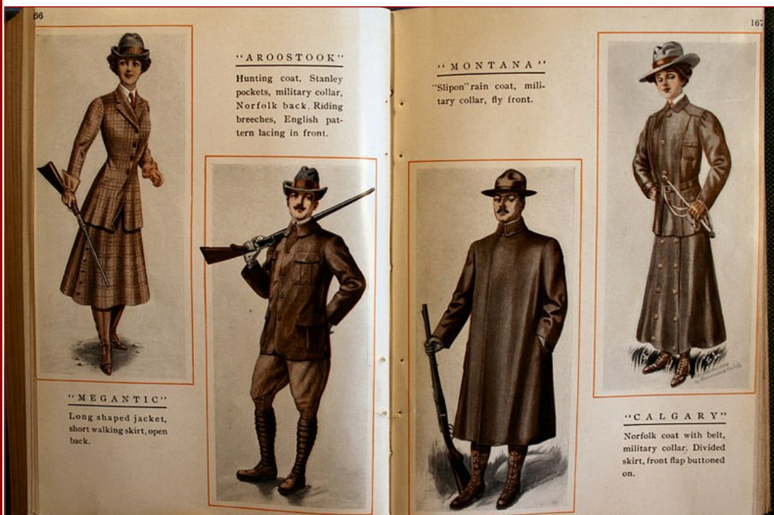
Men's and women's apparel advertised in Abercrombie & Fitch's initial (1909) catalog.

Very quickly, David Abercrombie and Ezra Fitch developed very different ideas of where