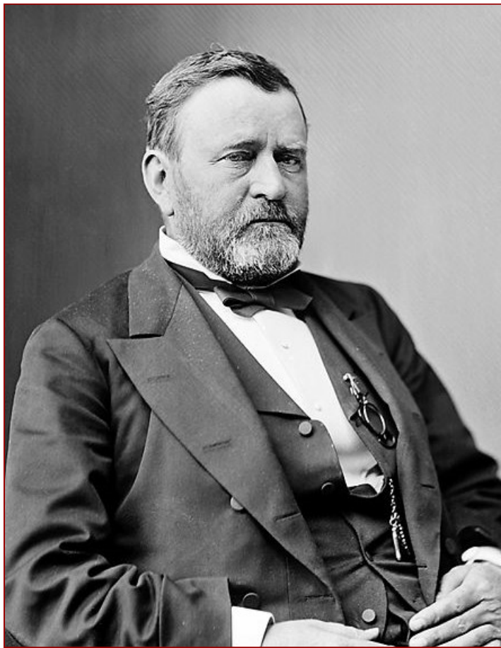
Ulysses S. Grant, 18th President of the United States

With the outbreak of the Civil War, Grant took responsibility for drilling volunteers in Galena. As the men he led grew in numbers, skills, and successes, Grant caught President Lincoln's notice. After his troops captured Vicksburg in July 1863, Grant was given command of all the federal armies in the West. Meanwhile, the war in the East had been going badly for the Union. In March 1864, Lincoln appointed Grant lieutenant general of the federal armies. Within little more than a year, Robert E. Lee had surrendered to Grant, and the Confederacy was defeated.